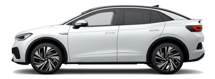
Glacier White Metallic<sup>1</sup>