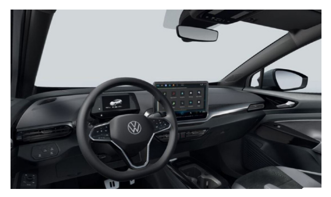
Standard from ID.5 PRO