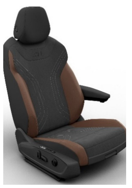
Artvelours Microfleece/Leatherette Soul/Florence Brown Standard from ID.5 PURE PLUS / PRO PLUS Optional on ID.5 PURE / PRO Electric controls are available via the addition of the Interior Plus Package