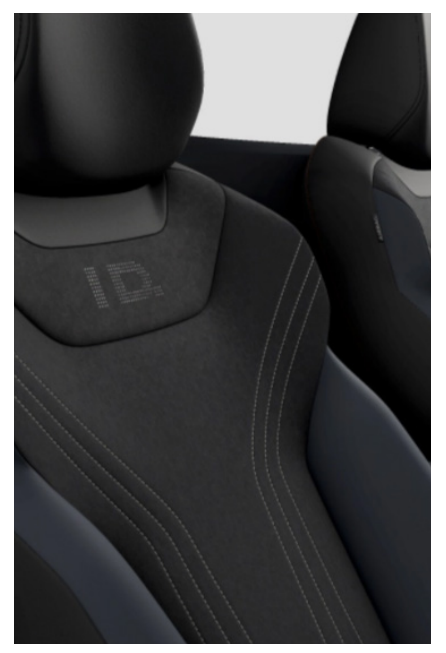
Artvelours Microfleece/Leatherette Soul/Platinum Grey Standard from ID.5 PURE PLUS / PRO PLUS Optional on ID.5 PURE / PRO Electric controls are available via the addition of the Interior Plus Package