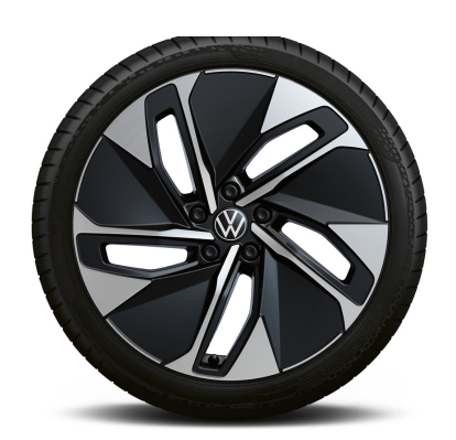
STANDARD ON ID.5 PURE PLUS /PRO / PRO PLUS Optional on ID.5 PURE

19" 'Hamar' alloy wheels 8J x 19 in front, 9J x 19 in rear Tyres: 235/50 R19 in front 255/45 R19 in rear