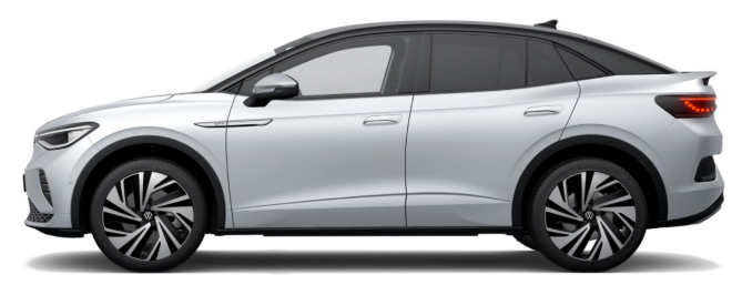
Scale Silver Metallic1,3