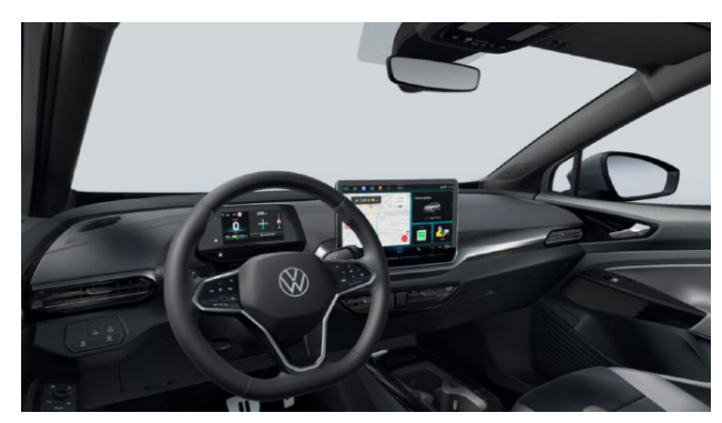
Standard from ID.5 PRO PLUS