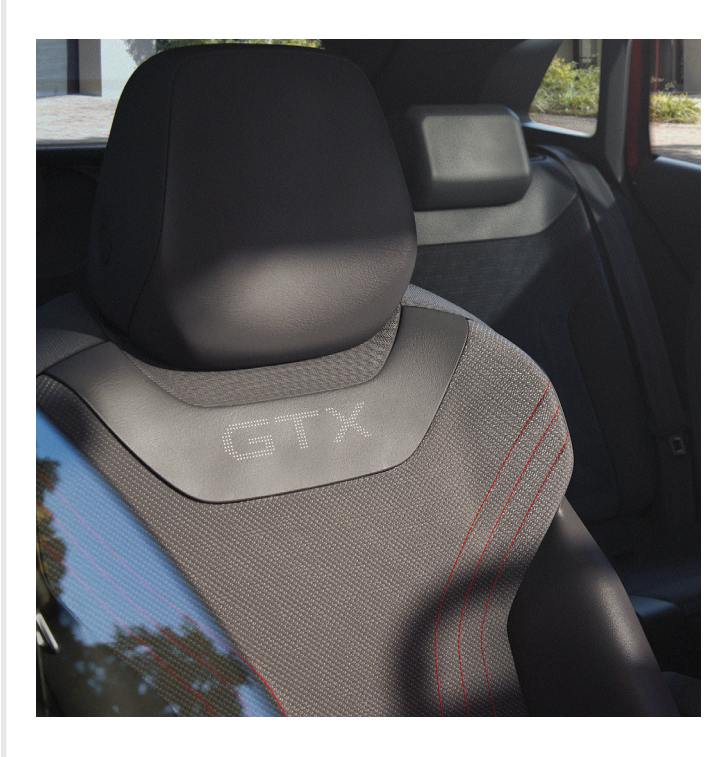
GTX Cloth/Leatherette Soul/Flash Red Standard on ID.5 GTX