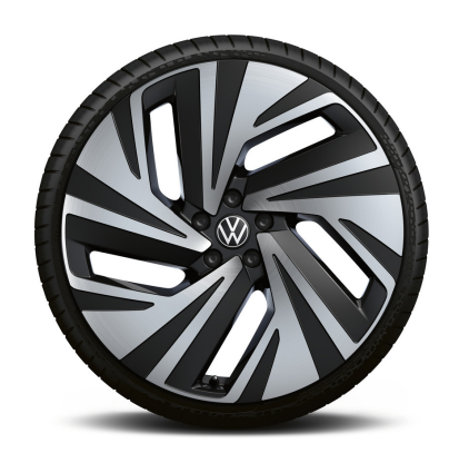
Optional on ID.5 PRO / PRO PLUS & ID.5 GTX

20" 'Ystad' alloy wheels 8J x 20 in front, 9J x 20 in rear Tyres: 235/50 R20 in front 255/45 R20 in rear