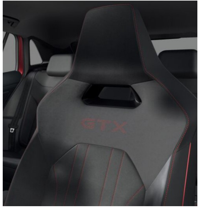
GTX Art Velours/Leatherette Soul/Flash Red Standard on ID.5 GTX PLUS Optional on ID.5 GTX

Note: Some parts of leather interior trim will contain artificial leather. Note: The print processes do not allow exact reproduction of the upholstery & insert colours.