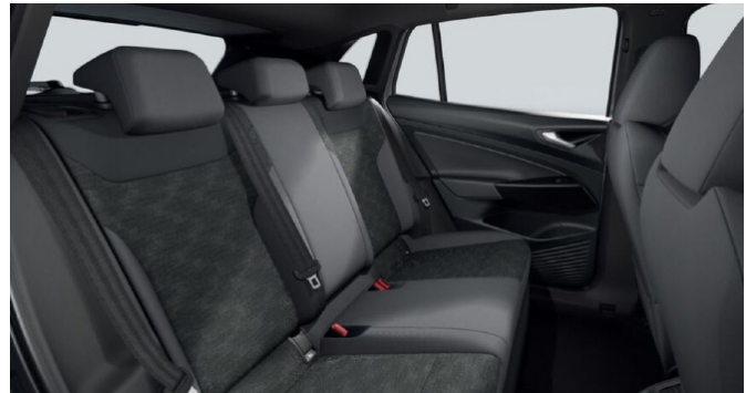
The above specifications are for information purposes only as our products are continually updated and changes may be made to the specifications at any time. If you require any specific feature, you must consult your local dealer who is regularly updated with any change in specification. Specifications are subject to change without notice.