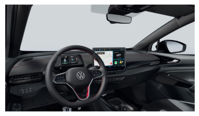
Standard on ID.5 GTX / GTX PLUS