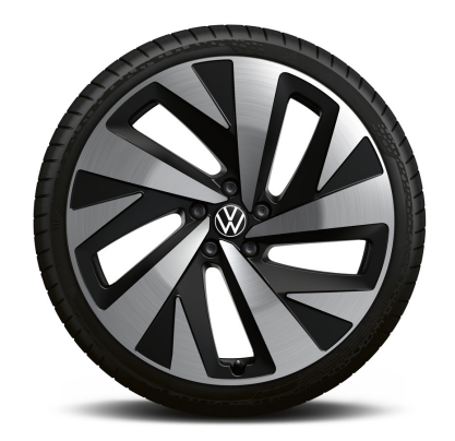
Optional on ID.5 PRO / PRO PLUS

19" 'Hamar' alloy wheels 8J x 19 in front, 9J x 19 in rear Tyres: 235/50 R19 in front 255/45 R19 in rear