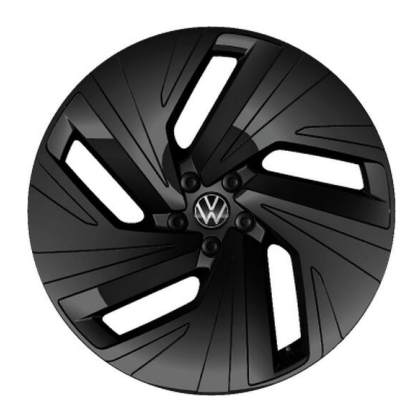
Optional on ID.5 GTX

20" 'Drammen' alloy wheels 8J x 20 in front, 9J x 20 in rear Tyres: 235/50 R20 in front 255/45 R20 in rear