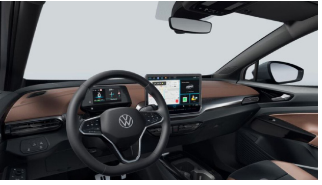
Standard selection from ID.5 PRO PLUS