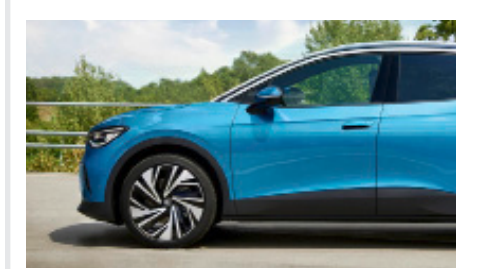
Costa Azul Metallic1,2