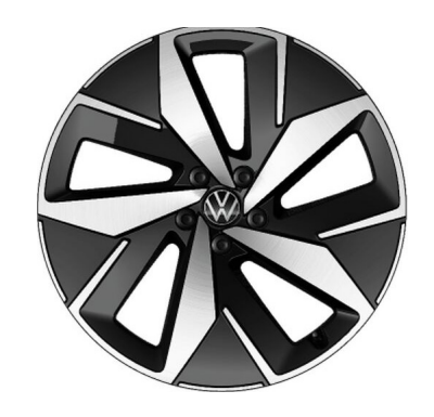
STANDARD ON ID.5 GTX / GTX PLUS

21" 'Narvik' in Black alloy wheels 8.5J x 21 in front, 9J x 21 in rear Tyres: 235/45 R21 in front 255/40 R21 in rear