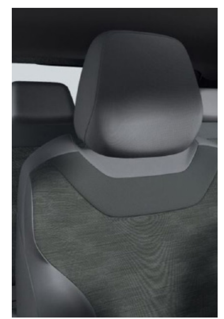
Fabric 'Matrix' Soul/Platinum Grey Standard from ID.5 PURE / PRO